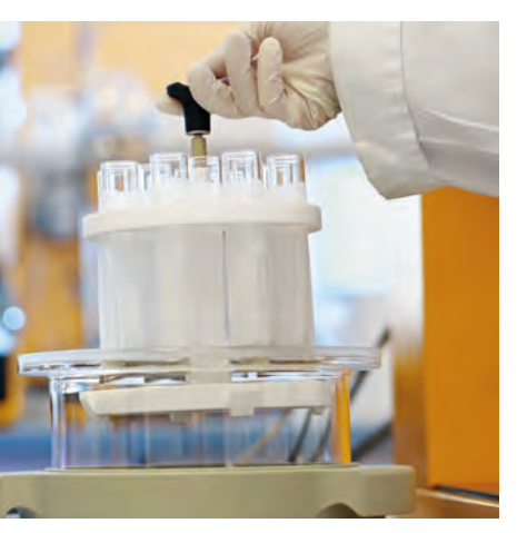
The removable handle makes it easier to insert and