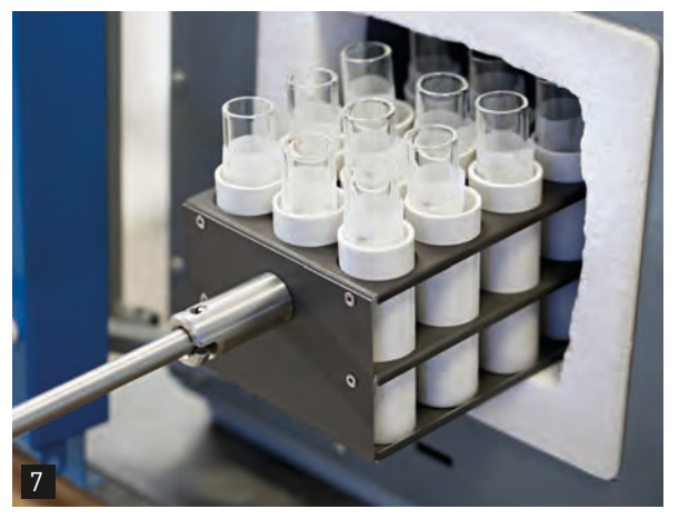
The incinerating module with a long handle makes handling of samples easier.