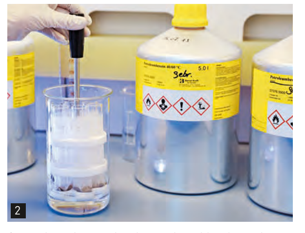
Convenient, time-saving degreasing with solvents in the degreasing module. 6 samples can be treated at the same time.